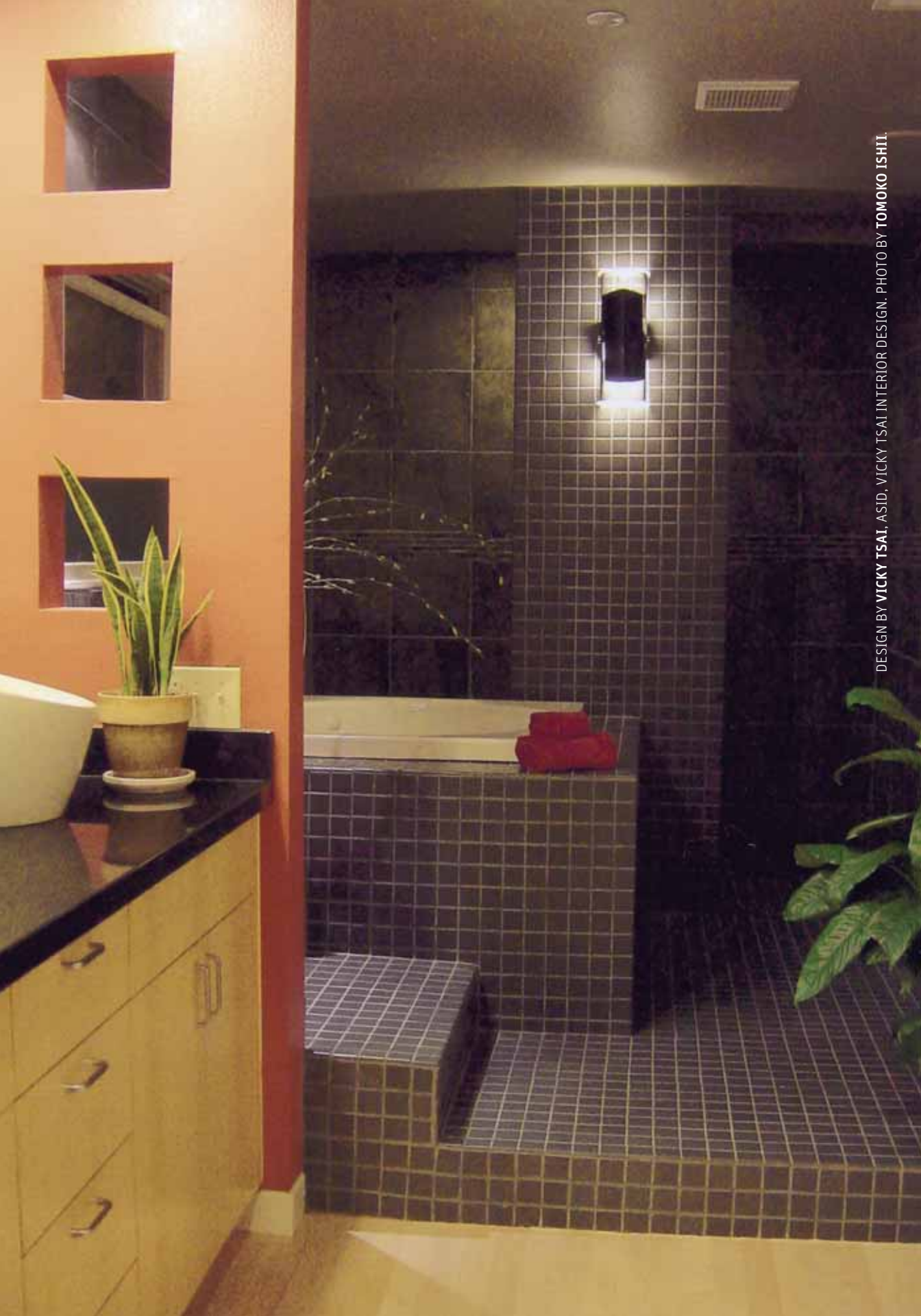
DESIGN BY VICKY TSAI. ASID, VICKY TSAI INTERIOR DESIGN.